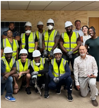
The first cohort of students in Boston with visiting Rare staff members in August 2024.